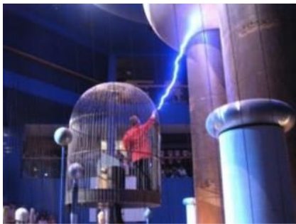
Van de Graaff Generator

The Workshop Banquet will take place in the Museum's Washburn Pavilion beginning at 6:00PM. This open-air pavilion is located directly on the Charles River with views of the Boston and Cambridge skylines. With refreshing breezes, cooling shade trees, and beautiful views, it's the perfect spot to socialize and dine under a protective tent.