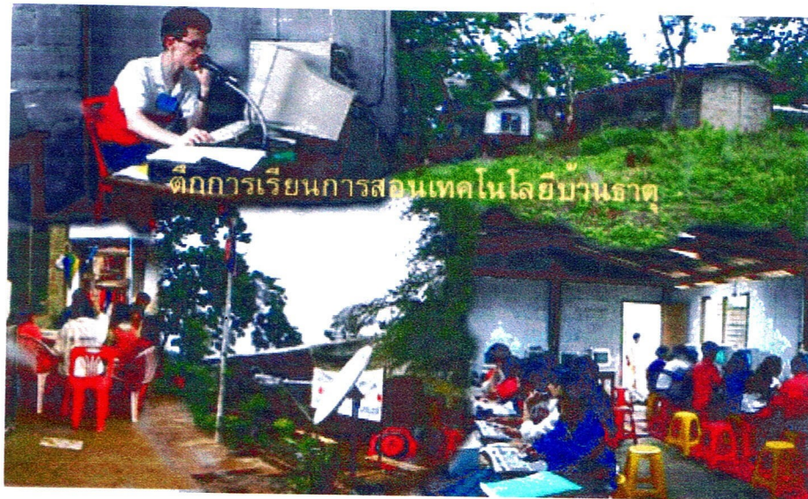
Figure 1: The learning center in the village of Ban Tart

Village members were involved in the entire experience, from designing the space to building the physical structure to making the electrical connections. This fostered a sense of authentic ownership and responsibility over the physical space, the equipment, and the activities and projects held in the learning center. At the same time, it reinforced the sense of community. We believe that intellectual and material ownership is important to guarantee the long-term success of any learning experience. However, in under-served communities ownership is also the best way to make sure that the expensive equipment involved in technological projects of this sort remains secure and protected while accessible to the community. In Mae Fah Luang, despite poverty, security is not an issue; the learning center remains open and unlocked 24 hours a day without supervision.