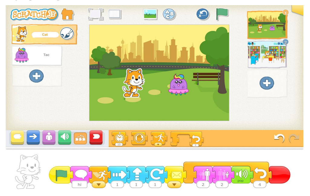
Figure 3. ScratchJr interface

are learning to read. Finally, both languages introduce children to core computational concepts of sequencing, repeat loops, and conditional statements.