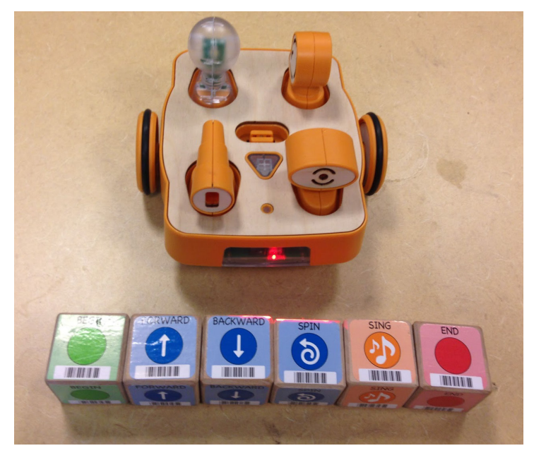
Figure 1. The KIBO robot

KIBO was chosen to represent a tangible programming technology because it is programmed without any screen time from tablets or computers. Children create a sequence of instructions (i.e., a program) using interlocking wooden programming blocks that represent different actions for KIBO to carry out. KIBO uses an embedded scanner to read the barcode on each programming block, and the completed program can be run with the pressing of a button. Prior research has shown that children in pre-kindergarten through second grade can learn engineering and programming concepts with KIBO (Elkin et al., 2016; Sullivan, Elkin, & Bers, 2015).