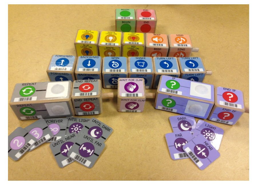
Figure 2. KIBO's programming language

KIBO's programming language is composed of over 18 individual wooden programming blocks (see Figure 2). Some of these blocks represent simple motions for the KIBO robot, such as move Forward, Backward, Spin, and Shake. Other blocks represent complex programming concepts such as Repeat Loops and Conditional "If" statements.