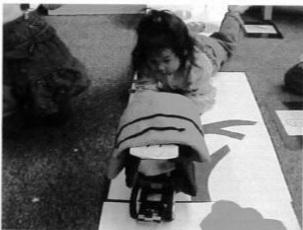
Figure 4: a three year old mounting a cocoon puppet on a robotic heart

In order to assess children's learning about metamorphosis, the student-teacher had them participate in a post-test. She also used extensive documentation, note taking, digital photography and video recording on the children's reactions, discussions and conversations, as well as the children's interaction with the technology.