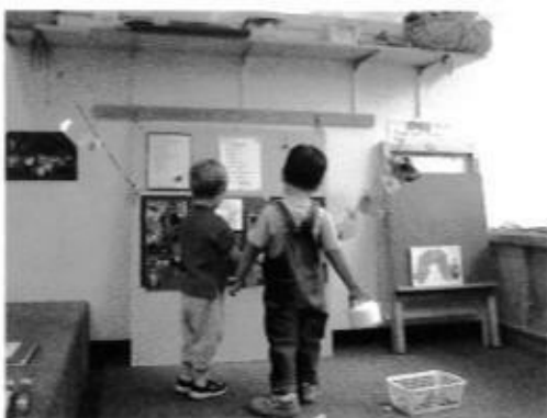
Figure 3: Children playing with clothesline representing stages of metamorphosis

Prior to this project all twelve children were unable to identify the phases of metamorphosis. For example, while reading the Hungry Caterpillar storybook (Carle, *) and playing with a clothesline that depicted the stages of the story for the children to look and play with, one boy told to his friend: "Look there are two animals here! A caterpillar and a butterfly!" (see figure 3). This little boy did not understand the concept that the insects were one and the same. By the end of the project, however, the majority of the children understood that although the exterior of the caterpillar changed throughout the phases, it was still the same insect. In fact, eight of the twelve children were capable of labeling the entire sequence.