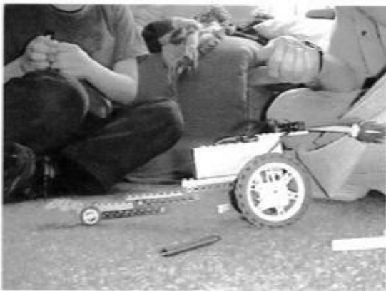
Figure 7 shows the dinosaur's structure with its tail

and found that the rear wheels were not positioned on a parallel axis. While struggling with ways to keep the dinosaur from falling over (it had only two wheels) one of the children made the observation: "If you put a dragging tail with wheels attached to the end it will make is stable." (see figure 7). The group accepted this and children engaged in an iterative design/building/programming process.