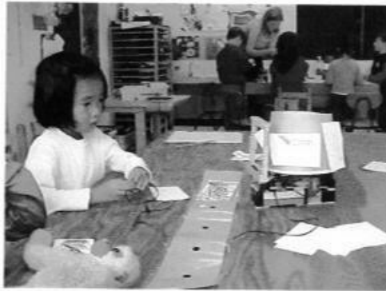
Figure 6: A girl controlling the robotic wheel with her own drawings of the life cycle

engineering design of the wheel, or the programming of its movement. However, they were in charge of controlling the contraption and deciding the chronological order of the stages of a tadpoles' life cycle by operating the wheel and its motion (see figure 6). They were very motivated to engage in the activity because of their interest in learning about the gears and the functioning of the technology.