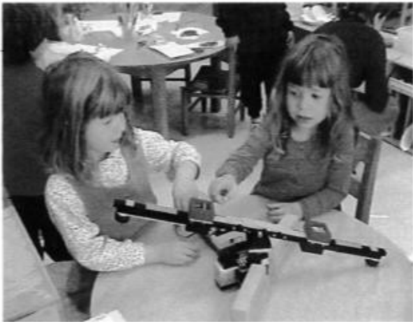
Figure 5 shows children suggesting to each other where weight should be added.

The activity took place during choice periods in a four-year-old classroom. First, the student-teacher read a book to the children which tells the story of a crane. She then invited the children to experiment with the crane in a collaborative way. The challenge was for each child to pick up metal pieces with the magnet on the crane and transport it to the other side of the wall by controlling the crane with a touch sensor. In order to complete the task the child had to add and take away tokens from either side of the lever. (see figure 5).