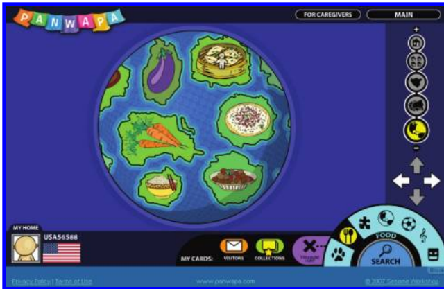
Figure 2 Screenshot of the Panwapa virtual world for preschoolers.

floating island that travels the five oceans of the world, developed in collaboration with Sesame Workshop and Merrill Lynch (figure 2). Launched in December of 2007, 50,000 children signed up for the site within the first five months (Shore 2008).