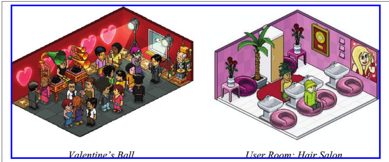
Figure 4 Screenshots of the Habbo virtual world.

A sense of purpose is important for the healthy development of children and youths, though how purpose manifests itself at each age level differs. For young children, purpose drives them to explore their world. For children, purpose drives them to develop their social skills with peers. For teens, purpose drives them to explore their identities. In virtual worlds, purpose is also a motivator as activities throughout the world mirror real life developmental stages. General considerations regarding purpose for all ages in virtual worlds include associated costs, openness of the community, and experience level of the user.