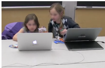
Figure 4: Preliminary testing of BacToMars with children. The two children pictured chose to play the game collaboratively without being prompted to do so.

Players then insert the genetic program into a digital plasmid (i.e. ring of DNA) and add the plasmid to a bacterial cell, which results in the growth of a colony of bacteria containing the genetic program. The players release the bacteria to Mars by dragging the petri dish with the colony towards the resource on the Martian landscape (see Figure 2). The bacteria gather around the resources they consume and produce a product, which is added to the products available in the bio-dome. The astronaut figures move around the bio-dome, providing feedback to users and indicating what products are running low, as well as picking up the products players create and consuming them or carrying them to where they are needed.