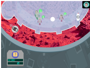
Figure 1: The first level of BacToMars. In this level, children are only allowed to make oxygen.