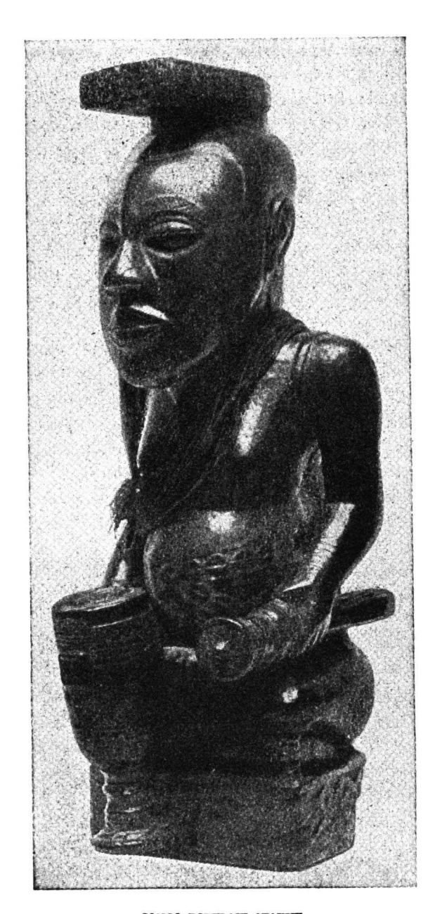
CONGO PORTRAIT STATUE